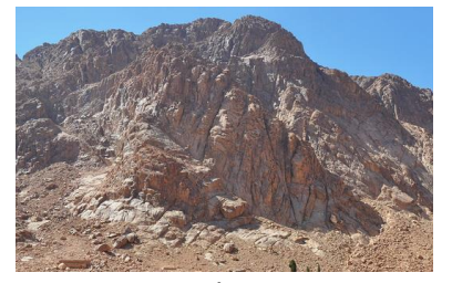
Mount Sinai today.

Ten Commandments – a special set of laws which God wrote and gave to Moses on Mount Sinai.