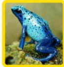
Poison Dart Frog