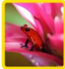
Strawberry Poison Frog