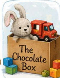
A TOY FROM THE 'CHOCOLATE BOX'