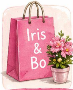
SHOPPING EXPERIENCE AT 'IRIS AND BO'