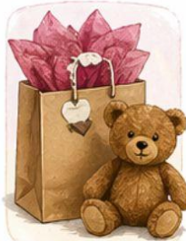
GIFTS FROM 'THE BURROW'