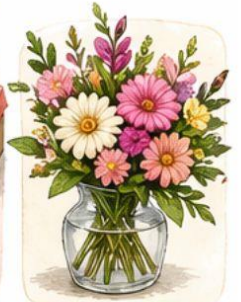
FLOWERS FROM 'NEW BEGINNINGS'