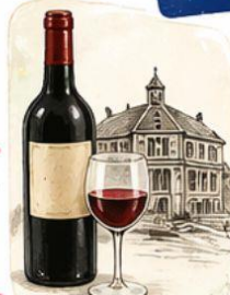
WINE FROM 'THE FLEECE'