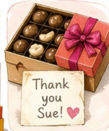
CHOCOLATES & GIFTS FROM OUR WONDERFUL COOK, SUE