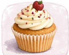
CUPCAKES FROM 'QUAVES LANE PATISSERIE'